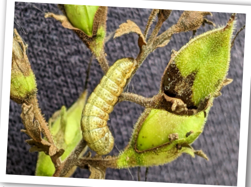
An orange sallow moth caterpillar on the seed head of its host plant: the fern-leaf false foxglove.

Special plants for specialized insects are critical for rehabilitating populations of rare species, but what about the broader ecosystem? This year, ZNE's Field Conservation staff planted hundreds of rare New England blazing stars ( Liatris novae-angliae ) at multiple field sites. This vibrant wildflower is a favorite nectar plant of monarch butterflies and a variety of native bees. These and other native wildflowers are being grown by our partners at the Arnold Arboretum for planting in 2023.