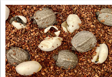
The wood turtle hatchlings, just as they began to emerge from their eggs.