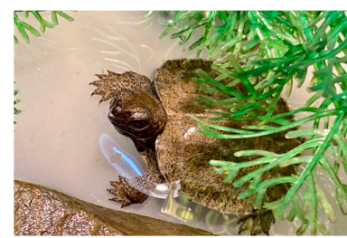
All seven turtles are currently being headstarted and will be released back to the site this summer.