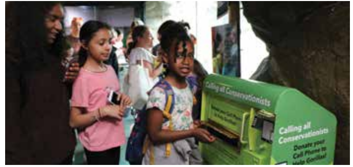
Students donating used cell phones for Gorillas on the Line

Closer to home, ZNE worked to help secure the passage of legislation in Massachusetts— An Act Regulating the Use of Elephants, Big Cats, Primates, Giraffes and Bears in Traveling Exhibits and Shows . It was a powerful victory for many species who are ill-suited for such shows, and also important for the