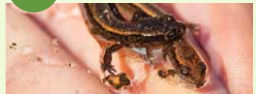
Northern two-lined salamander