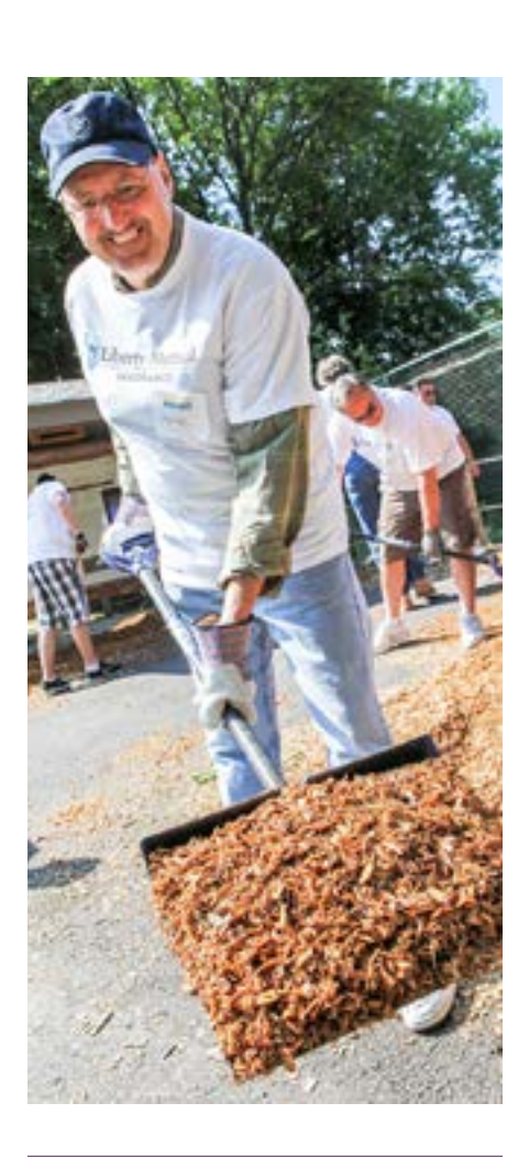
A total of 33,917 hours of essential services were contributed by 1,508 individual volunteers, interns, and group volunteers in FY 15.

Schwartz & Schwartz Single Volunteers of Boston Takeda Pharmaceuticals USS Constitution