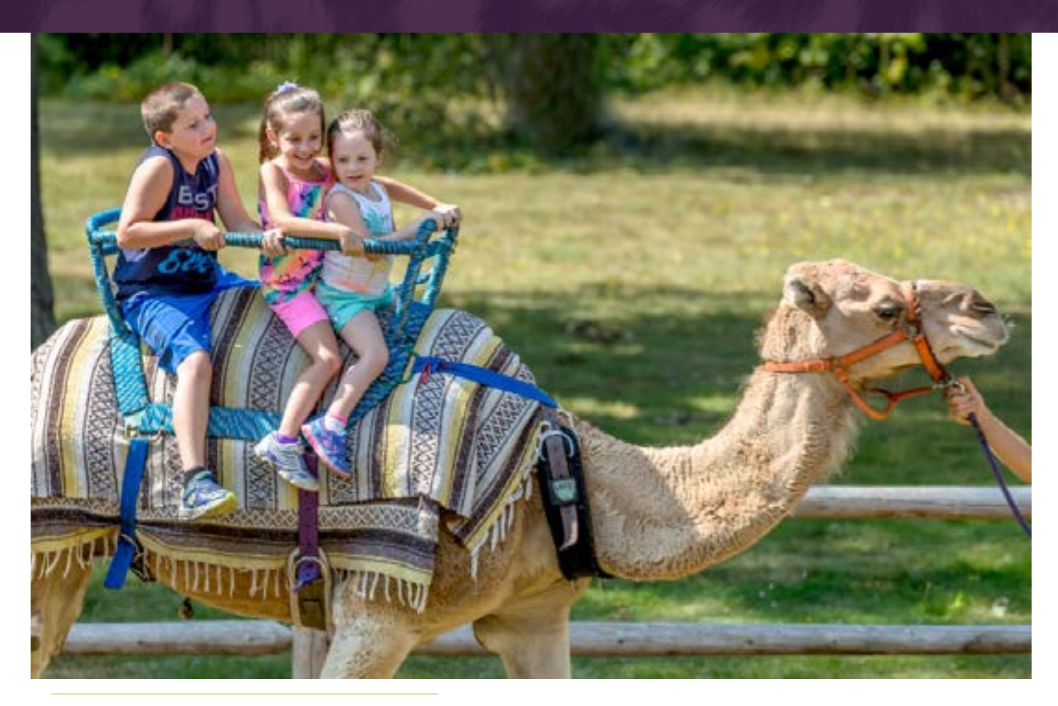
▲ Pictured above, Camel Trek, a new seasonal experience at Franklin Park Zoo, debuted in May 2015.