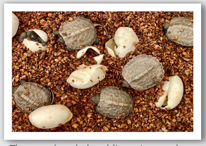
The wood turtle hatchlings, just as they began to emerge from their eggs.