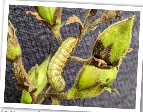
An orange sallow moth caterpillar on the seed head of its host plant: the fern-leaf false foxglove.

Special plants for specialized insects are critical for rehabilitating populations of rare species, but what about the broader ecosystem? This year, ZNE's Field Conservation staff planted hundreds of rare New England blazing stars ( Liatris novaeangliae ) at multiple field sites. This vibrant wildflower is a favorite nectar plant of monarch butterflies and a variety of native bees. These and other native wildflowers are being grown by our partners at the Arnold Arboretum for planting in 2023.